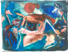
Nocturnal fox visit in New York 2023 ink and watercolor on paper 9 x 12 inches

Opening Reception: Friday, June 30, from 6–9PM Performance Tingling Entanglements by Sophie Schmidt at 7PM