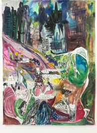
I bite you tenderly 2023 ink and watercolor on paper 30 x 22 inches