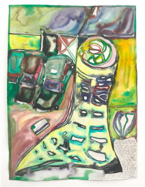
Skyscraper boot 2023 ink and watercolor on paper 41,5 x 31 inches