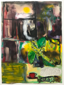
My dust dances in the sun, I enter through the gaps, in all mouths, fill every hole. 1 2023 ink and watercolor on paper 41,5 x 31 inches