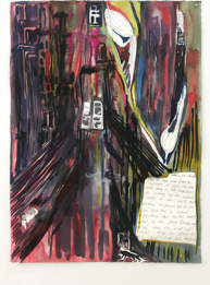
Highest Swings of the World 2023 ink and watercolor on paper 30 x 22 inches