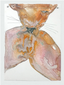
The World is now licked with the Tongue 2023 ink and watercolor on paper 12 x 9 inches