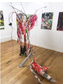
Mückenkrebs (Mosquitocrab) 2023 shock absorbers, sticks, plaster, tape, dye, paper, wire, tampons, cotton swabs, forks, whisks, pomegranate, colanders, stainless steel scrubbers, tubes, plastic bags, eggs, paper towels, umbrella frame approx. 8 x 9 x 3 feet