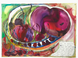
Cherry-5thAve-Chain 2023 ink and watercolor on paper 22 x 30 inches