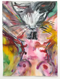
Cat meets woman 2023 ink and watercolor on paper 30 x 22 inches