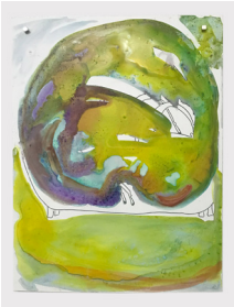
Baptism in Harlem 2023 ink and watercolor on paper 12 x 9 inches